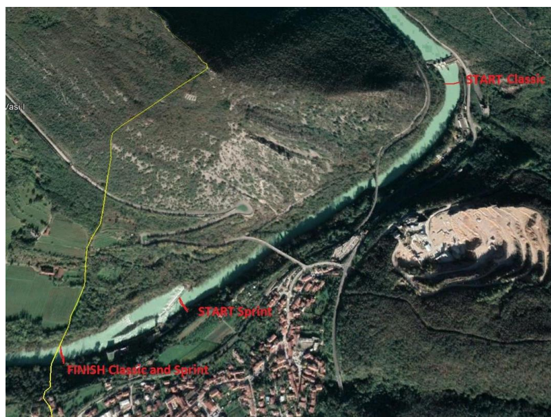
Classic and sprint draft scheme